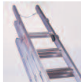
Ladders glass fibre